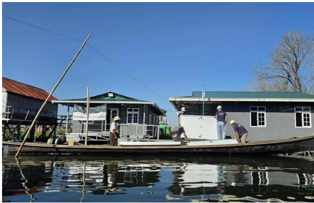
Two Floating shelters stationed at Nampan (Ye Ale) Village

through contributions from local donors and constructed by a local contractor, reflecting strong community participation and local ownership. The facilities are strategically located at Nampan (Ye Ale) Village and are designed to serve multiple functions, including emergency shelter during disaster events as well as a meeting venue and community center during normal periods. Currently, the shelters are actively utilized by IYVN for community meetings, mobile clinic during the festive days, women and youth-led initiatives, demonstrating a practical and context-appropriate model for multipurpose, disaster-resilient infrastructure in the Inle Lake.