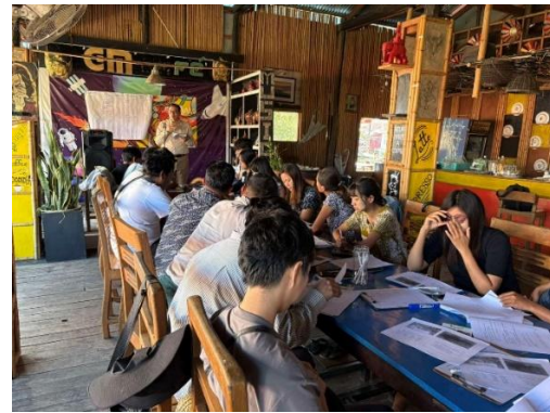
Meeting with local CSOs, CBOs and NGOs at Heya Ywar Ma