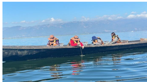
On-site Water Quality Measurement in the mid location of the lake