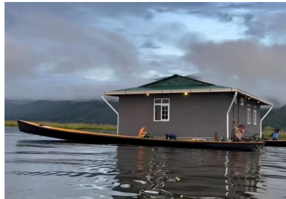
Floating shelter on the move