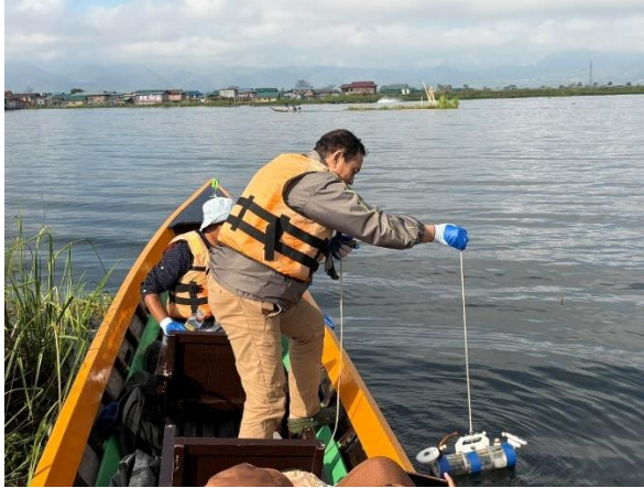
On-site water sampling using Niskin Sampler