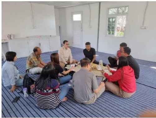
Meeting with IYVN on the floating shelter.