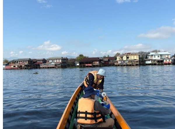
On-site water sampling near the out let of Inle Lake, downstream of NamPan Ye Ale Village