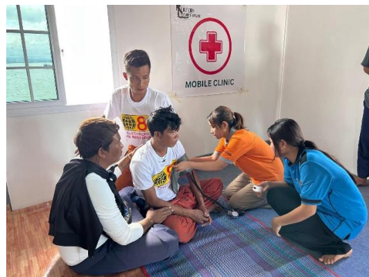
Inside a floating shelter used as a mobile clinic