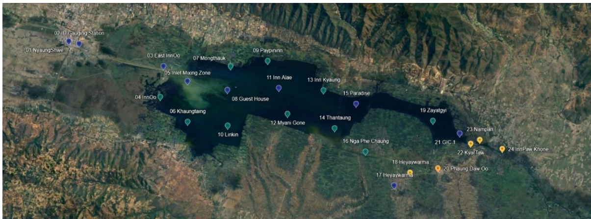
Figure 2-7 Proposed sampling locations for water quality monitoring

Monitoring Methodology: The most modern and effective method involves installing automatic monitoring buoys/stations at various points across the lake, transmitting data in real-time via radio or mobile networks to a central office. However, methods suitable for Myanmar's current context must be employed. Therefore, it is first necessary to strategically define traditional water sampling points and parameters. A monitoring plan must be developed based on available funding and human resources. Below is the proposed sampling locations of monitoring points selected for long term water quality monitoring of Inle Lake.