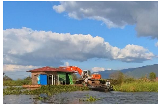
Dredging work in Nga Phal Chaung, Inle 16 November 2025