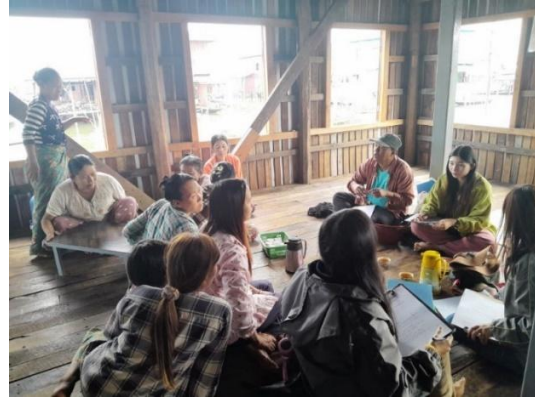
Meeting at Kyay Sar Kone