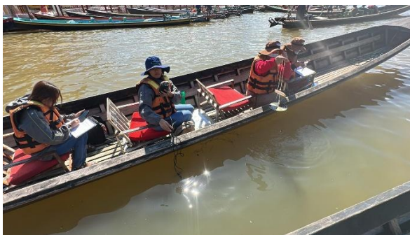
On-site Water Quality Measurement near Phaung Daw Oo Pagoda

To effectively address the above problems and restore Inle Lake's water quality, developing a continuous Water Quality Monitoring System is crucial.