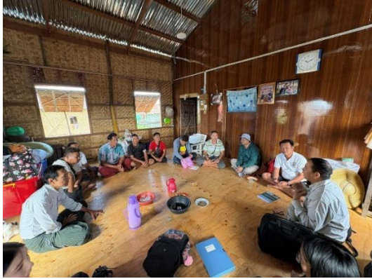
Meeting at Pauk Pa Village