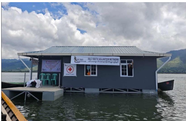
Floating shelter used as a mobile clinic