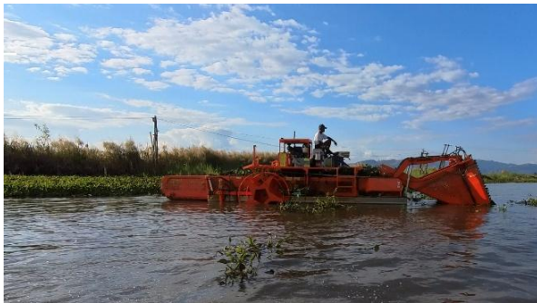
Hyacinth clearing in Nga Phal Chaung, Inle 16 November 2025

lake health and accessibility, a year-round maintenance approach is necessary. This requires the dedicated procurement and deployment of appropriate Dredging Equipment and Water Hyacinth Clearing Equipment, supported by a planned maintenance schedule and dedicated operational budget. Implementing a program of Regular Dredging and Regular Maintenance Clearing throughout the year will prevent acute blockages, improve water flow and quality consistently, and is a more cost-effective and ecologically sound strategy than repeated crisis intervention.